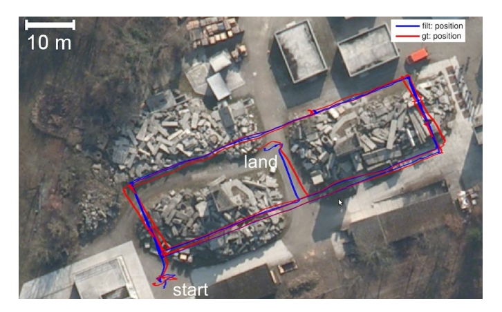
Fig. 3. Trajectory flown in a disaster area. After a short initialization phase at the start, vision-based navigation (blue) was switched on for successful completion of a more than 350 m-long trajectory, until battery limitations necessitated landing. The comparison of the estimated trajectory with the GPS ground truth (red) indicates a very low position and yaw drift of our real-time and onboard visual SLAM framework.

http://www.ros.org/wiki/asctec_mav_framework