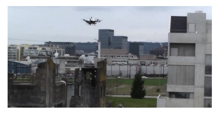
Fig. 1. The MAV operating in a desaster area, only using measurements from a monocular camera and IMU for localization

We choose a minimal sensor suite onboard our MAV, consisting of a monocular camera for sensing the scene and an Inertial Measurement Unit (IMU) providing estimates of the MAV acceleration and angular velocity. While this choice implies low power consumption and wide applicability of algorithms (e.g. same sensor suite exists in smart phones),